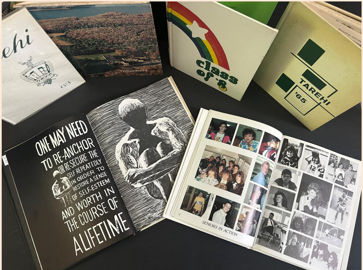
TAHANTO YEARBOOKS Early Years Boylston Historical Society Fuller Library Collections