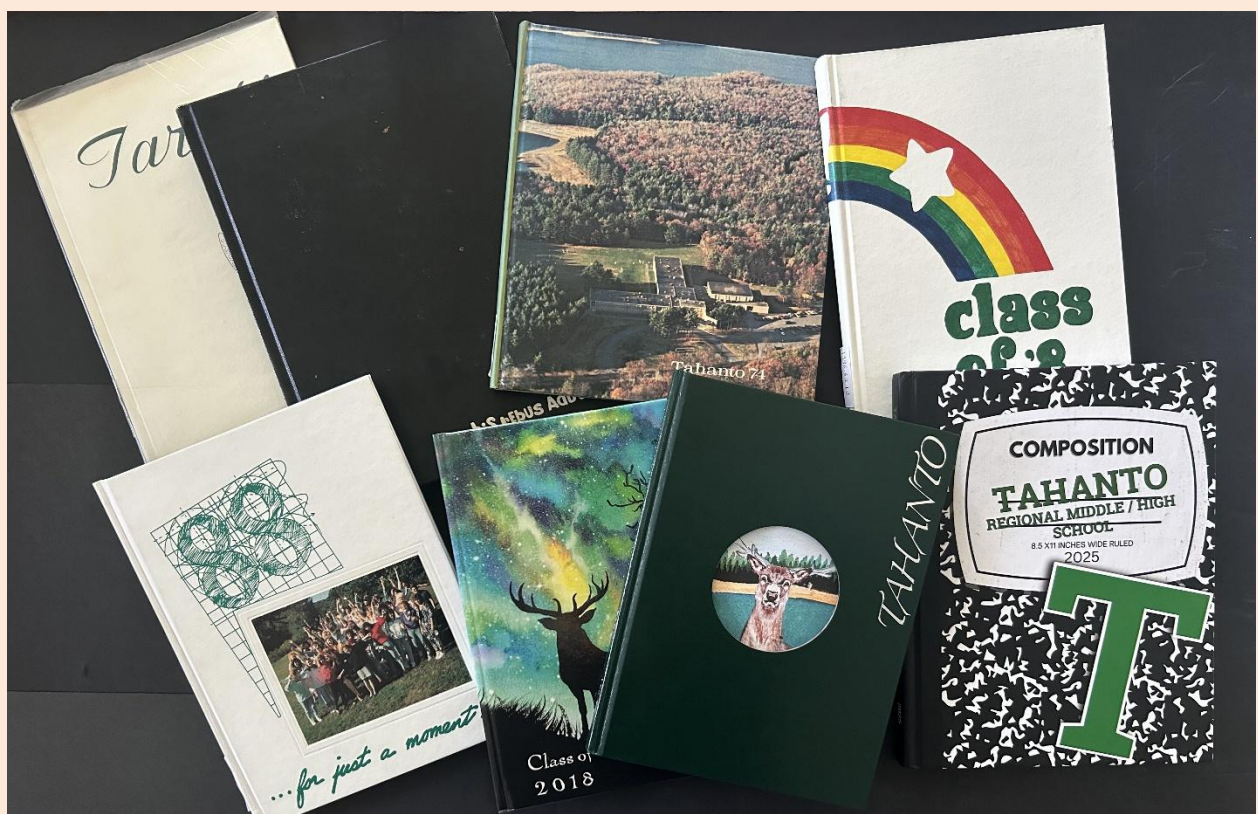
Tahanto Yearbooks 1962 to 2025

The yearbook of 2025 is vastly different from the one of 1963. The focus shifted from the book itself to the memories it contains. Yearbooks of the 21st century now contain superlative titles and candid photographs. Interestingly enough, the yearbook of 2020-21 has little mention of COVID-19, something that would have definitely been mentioned by the people of the 1960s. On the back cover of the 2025 book, student artwork is shown, reminiscent of the showcase from the 1970 yearbook.